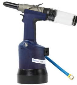
NG4 AIR-HYDRAULIC TOOL Capacity: 3/16" & 1/4" diameter Maxlok® Lockbolts Weight: 5.2 lbs. - Pulling Force: 4,200 lbs. - Stroke: .670" Please specify size of Lockbolt when ordering.

AVDEL MAXLOK® Lockbolt system is a two piece fastener consisting of a Lockbolt and Collar. The Lockbolt is placed through the work and the Collar is placed over the end of the Lockbolt. Using the proper tool the two are swagged together and the Lockbolt is broken off flush with the collar. This fastener has a very wide grip range and exceptional clamp-up force, shear and tensile strengths.