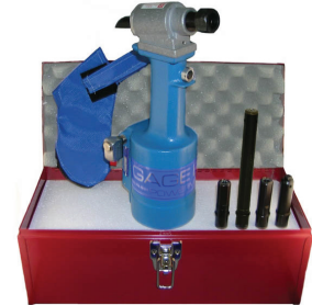
GBP722TCKL Blind Rivet and Lockbolt Kit For more details please visit our website www.hansonrivet.com