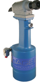
GB722 AIR-HYDRAULIC TOOL Capacity: Standard Blind Rivets up to 1/4" diameter Lockbolts up to 3/16" & Multi-Grip Lockbolts up to 1/4" diameter In all materials Weight: 5.50 lbs. - Pulling Force: 4,700 lbs. Stroke: .590" Nose Assembly Not Included