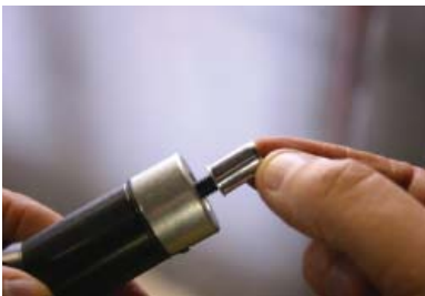
1. Spin on Insert