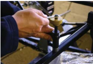
2. Turn knob by hand or wrench